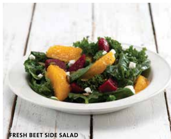
FRESH BEET SIDE SALAD

All prices are nett inclusive of 10% Service Charge and 6% Service Tax. Images shown are for illustration purpose only.