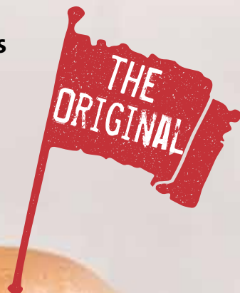
ORIGINAL LEGENDARY® BURGER

Since 1971, we've been serving burgers to legends who love great taste and Rock n' Roll. We're proud to serve premium, 100% Fresh Certified Black Angus Beef Steak Burgers. Just like the strings of a guitar must be perfectly tuned to play a great melody, every detail matters for Hard Rock's Legendary® Steak Burgers.