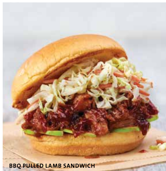
BBQ PULLED LAMB SANDWICH