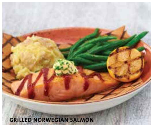
GRILLED NORWEGIAN SALMON

If you suffer from a food allergy, please ensure that your server is aware at time of order.