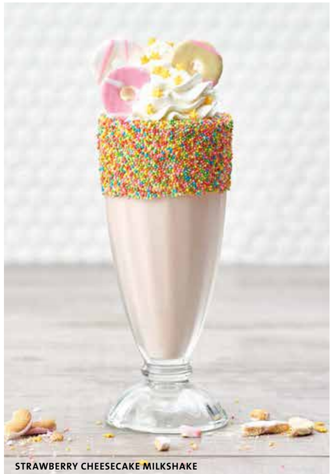
STRAWBERRY CHEESECAKE MILKSHAKE

If you suffer from a food allergy, please ensure that your server is aware at time of order. † Contains nuts or seeds.