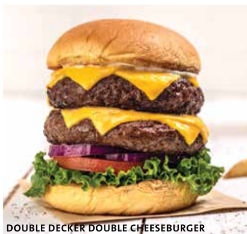
DOUBLE DECKER DOUBLE CHEESEBURGER

If you suffer from a food allergy, please ensure that your server is aware at time of order.