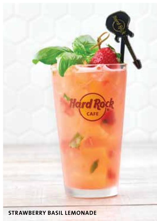
STRAWBERRY BASIL LEMONADE