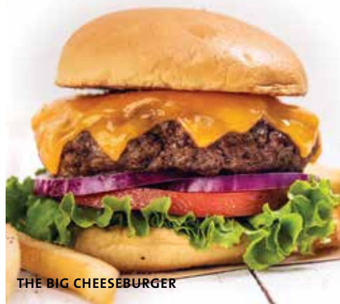
THE BIG CHEESEBURGER

NEW Milkshakes RM35 (Choose Strawberry Cheesecake or Cookies & Cream)