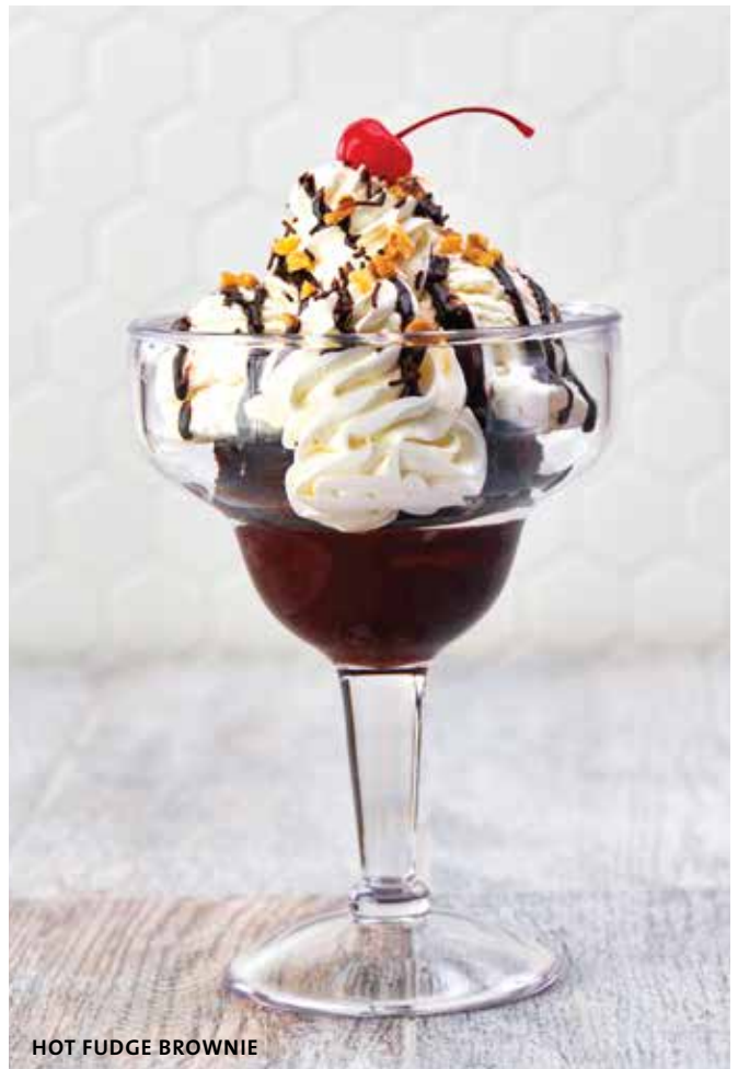
HOT FUDGE BROWNIE

Choose from vanilla, chocolate or strawberry. Small RM19 Large RM34