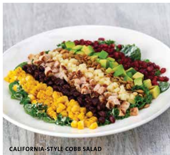
CALIFORNIA-STYLE COBB SALAD