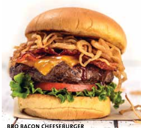
BBQ BACON CHEESEBURGER