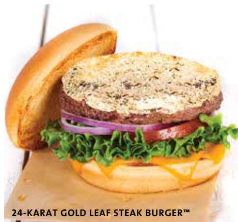
24-KARAT GOLD LEAF STEAK BURGER™