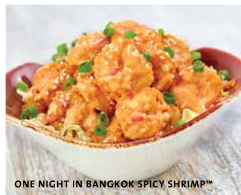
ONE NIGHT IN BANGKOK SPICY SHRIMP™

A creamy blend of romano and cheddar cheese, chopped spinach and artichoke hearts, served with crispy tortilla chips and house-made pico de gallo on the side. RM45