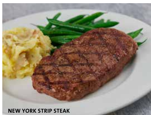
NEW YORK STRIP STEAK