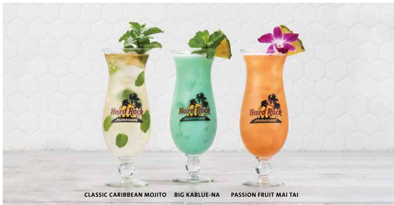
CLASSIC CARIBBEAN MOJITO