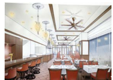
Old City Grill House (image)

With the motto "a steakhouse feast for all five senses", the Old City Grill House offers a variety of regional dishes, including lobster rolls, New England clam chowder, and, representing the Southern United States, Cajun cuisine. Craft beers that pairs with the foods will also be provided.