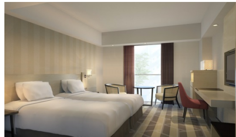
Guest Room: Comfort Twin Room (image)

Based on the concept “Hospitality from the moment you book”, Shiba Park Hotel 151 hopes for its guests to understand more about Japan, to fall in love with our country, and experience the true meaning of hospitality, which we call “ omotenashi ”. With this concept in mind, while we are a city hotel, the Shiba Park Hotel 151 offers services to provide Japanese inn-style hospitality.