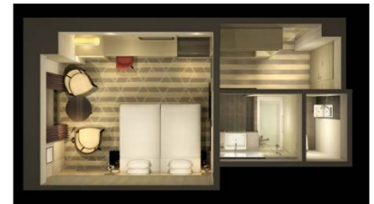
Comfort Twin Room plan view (image)

Additionally, all rooms feature a separate air conditioning system, making for a relaxing stay.