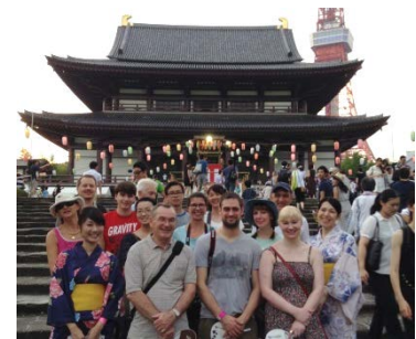
Escorted tour to Bon Dancing (image)