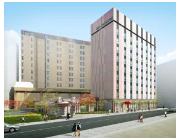
Exterior of Shiba Park Hotel 151 (image)

Shiba Park Hotel is easily accessible from Haneda and Narita airports and is located near Zojoji and Tokyo Tower, symbolic of Tokyo. The hotel consequently has a high proportion of foreign guests, with the average accommodation rate rising to 71% in 2015. In order to create a hotel mainly targeting international tourists whose numbers are expected to increase further, the main building of the Shiba Park Hotel which had hosted many guests since 1960 is now under construction. It is due to re-open as the Shiba Park Hotel 151.