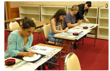
Japanese Calligraphy Workshop (image)

Name: Japanese Culture Salon SAKURA Place: 2nd floor, Shiba Park Hotel 151 Open hours: Varies depending on event Participation Fee: Varies depending on event