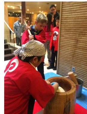
New Year's Event 2016