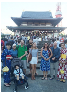
Bon dancing Event 2016