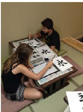
Calligraphy Workshop 2016