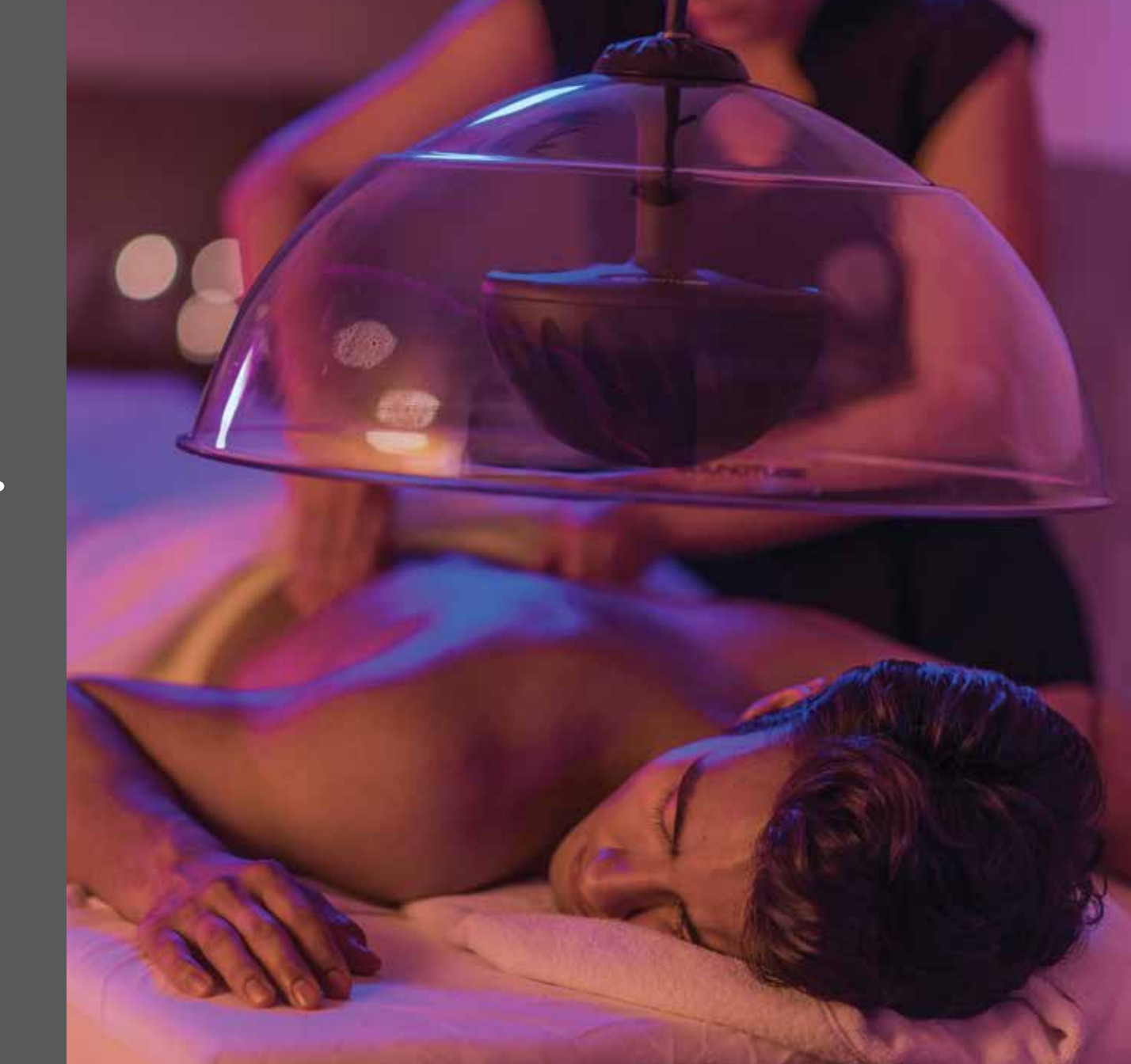
table as treble beats come from above, sending pulses through the body and leaving you feeling energized and invigorated.