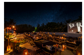
Private Viewing at Cinema Paradiso