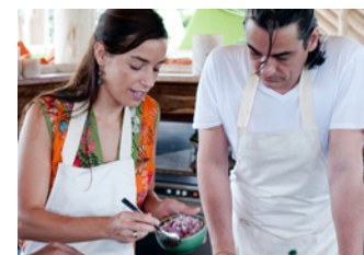
Cooking class Grand Ma's recipe, Baking, Chocolate & Ice-cream making