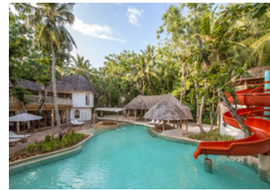
Grand parents & children at the Den, parents to Spa