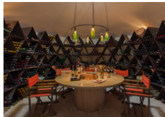
Wine & Juice tasting