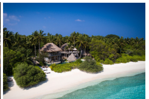
SONEVA FUSHI VILLAS