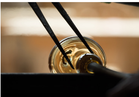
SONEVA ART AND GLASS