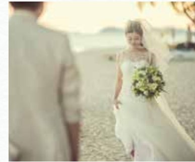
48-67 Soneva Kiri, Thailand