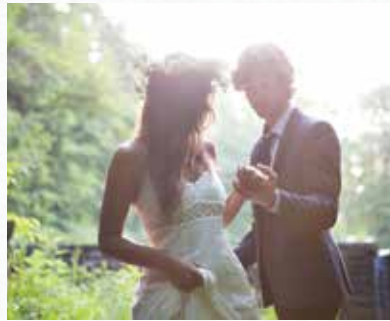
08-27 Soneva Fushi, Maldives