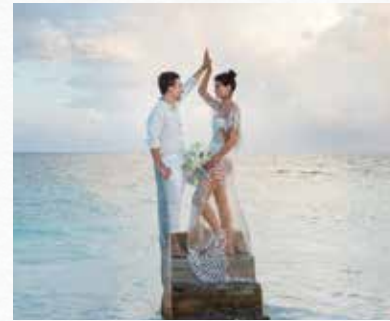
30-41 Soneva Jani, Maldives