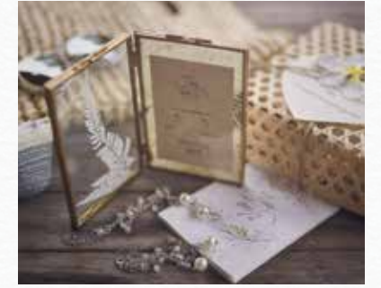
68-73 Wedding checklist Testimonials FAQs