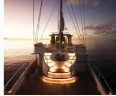
42-47 Soneva in Aqua, Maldives