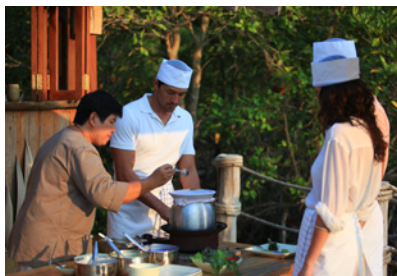
Thai heritage cooking demonstration