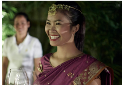
Introduction to Thai Language Class