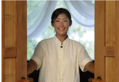
Mr. or Ms. Friday personal butlers