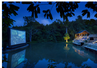
Regular movie screenings at Cinema Paradiso with complimentary gourmet popcorn and ice-cream