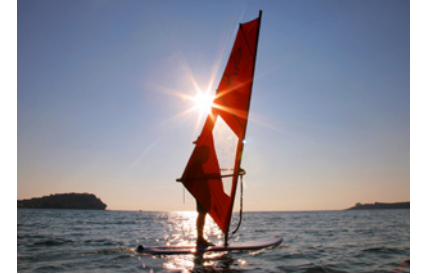
Non-motorized watersports: paddle-boarding, catamaran sailing, windsurfing and canoeing