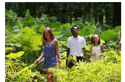
A tour of our Eco-Centro Waste-to-Wealth centre and organic vegetable gardens, where you can learn about the best practices in eco-sustainability