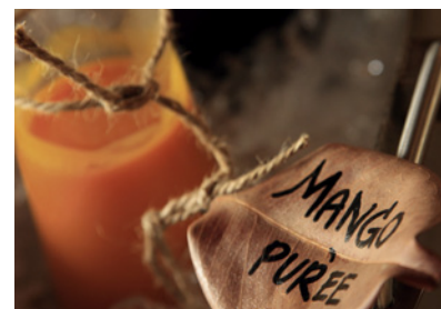
Welcome drink, cold towel and fresh fruit in the villa upon arrival