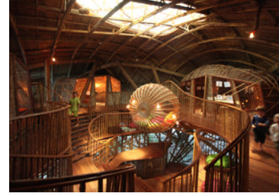
Access to the Children's Den and Eco Den, as well as inclusion in the year-round summer camp programme