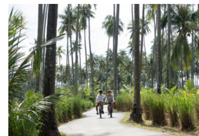
Personal bicycles or tricycles for every guest