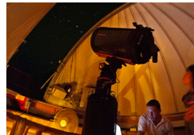
Introduction to astronomy with our resident Astronomer at our Observatory