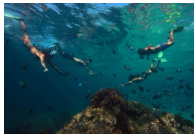
Introduction to snorkelling