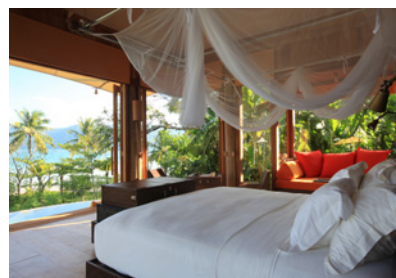
Use of Wireless Internet access in the villa and designated public areas