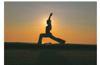
Yoga and Meditation at our Six Senses Spa