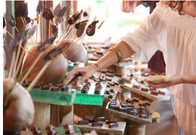
Access to our home-made chocolate, ice-cream, cheese and charcuterie parlours