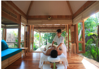
A Himalayan singing bowl class, a homemade coconut oil making class, and an introduction to back massage at our Six Senses Spa