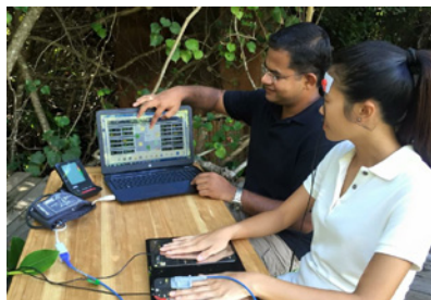
Introduction to wellness screening with our resident Ayurvedic doctor