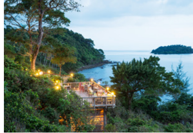
A weekly sunset cocktail party at The View Restaurant