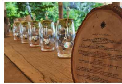
Vita Jewel Water Testing