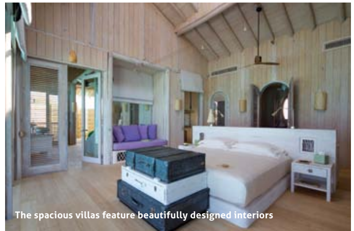
The spacious villas feature beautifully designed interiors