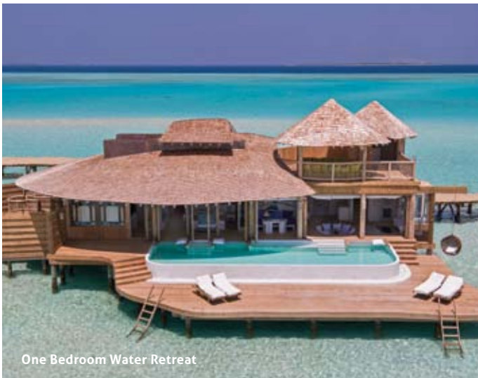
One Bedroom Water Retreat