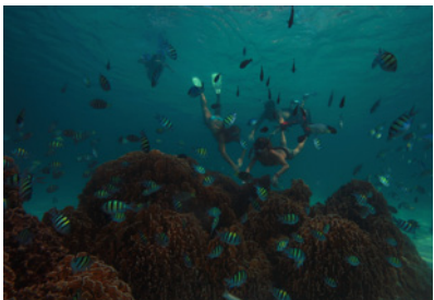
Snorkelling with our resident marine biologist