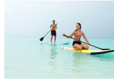
Non-motorized watersports: paddle-boarding, catamaran sailing, windsurfing and canoeing