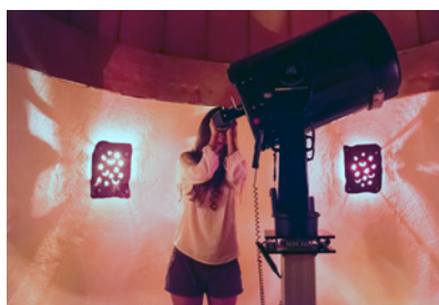
Introduction to astronomy with our resident Astronomer at our Observatory