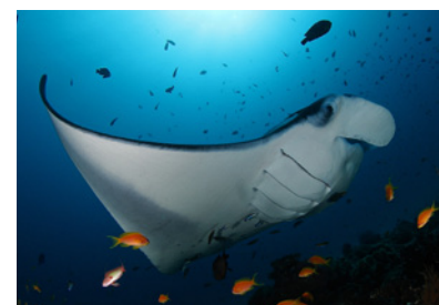
A marine biology presentation by our resident Marine Biologist