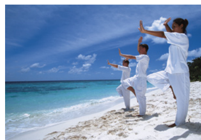
Yoga and Meditation at the Turtle Beach Champa