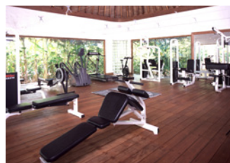
Use of fully equipped gym and tennis courts