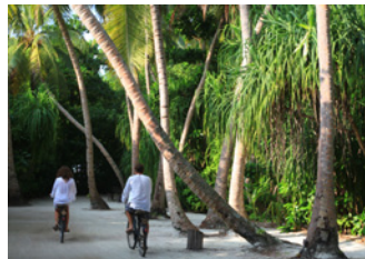
Personal bicycles or tricycles for every guest