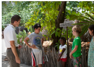
A tour of our Eco-Centro Waste-to-Wealth centre and organic vegetable gardens, where you can learn about the best practices in eco-sustainability