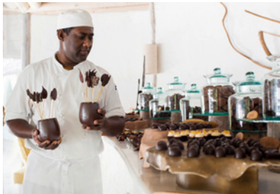
Access to our home-made chocolate, ice-cream, cheese and charcuterie parlours