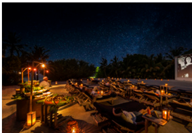
Regular movie screenings at Cinema Paradiso, the widest screen in the Indian Ocean, with complimentary gourmet popcorn and ice-cream