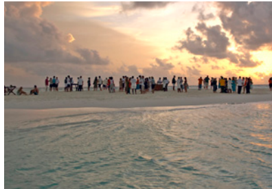
A weekly sunset cocktail party on our sandbank