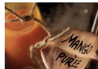
Welcome drink, cold towel and fresh fruit in the villa upon arrival