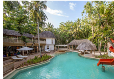
Access to the Children's Den and inclusion in the year-round summer camp programme