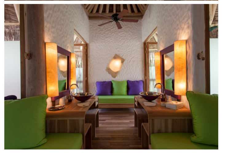
More images: http://www.soneva.com/soneva-fushi/villas/villa-14/