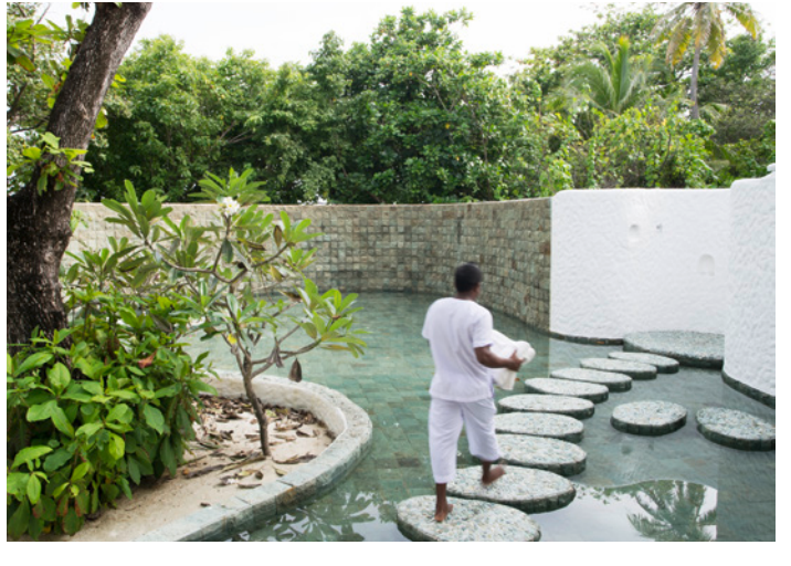
More images: http://www.soneva.com/soneva-fushi/villas/villa-one/